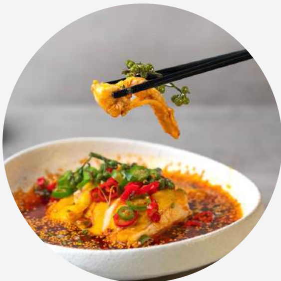
Numb · 口水双椒鸡